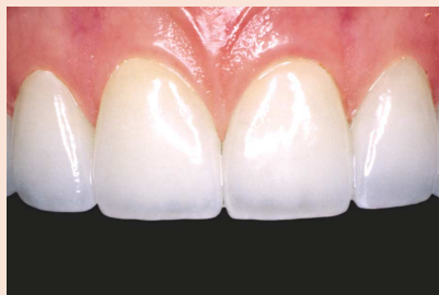
FIGURE 4. This is a typical IPS Empress veneer smile enhancement that creates a natural-looking result.