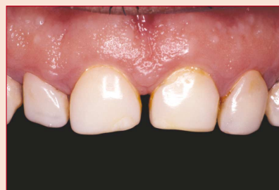
FIGURE 7. The patient presented with multiple diastemata and requested a brighter smile.