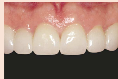
FIGURE 8. Using minimal tooth preparation, the feldspathic veneers improved aesthetics and contours.