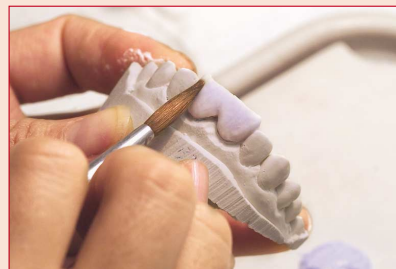
FIGURE 5. Feldspathic porcelain is built-up on a refractory model using internal modifiers, body, and enamel powders.