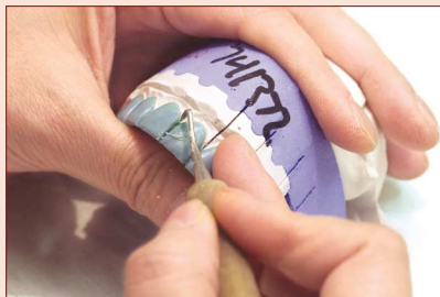
FIGURE 1. The IPS Empress restoration is fabricated by waxing the veneer on the master die, investing, and pressing into ceramic.