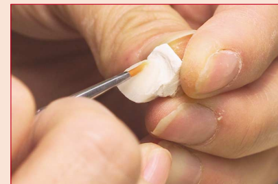
FIGURE 6. After firing, the veneers can be further modified with stain and then glazed for final aesthetic results.