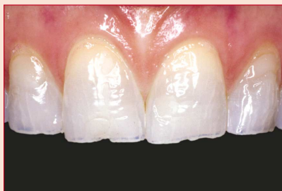
FIGURE 3. The patient presented with worn incisal edges and desired longer teeth.